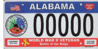
Battle of the Bulge