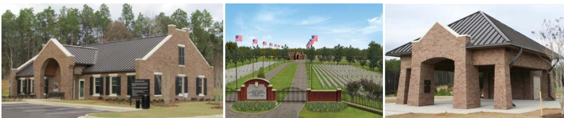
Alabama State Veterans Memorial Cemetery, 34904 Alabama Highway 225, Spanish Fort, AL 36577 Tel: (251) 625-1338 Website: www.va.alabama.gov

The Alabama State Veterans Memorial Cemetery at Spanish Fort sits on over 120 acres of land in Baldwin County, Alabama. The cemetery was dedicated in December 2012 and began interments in April 2013. The initial phase of the cemetery is 22.8 acres and has 2,776 burial sites (2,392 in-ground). The lifespan of the entire cemetery is 100 years.