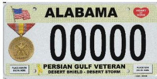
Desert Shield / Desert Storm