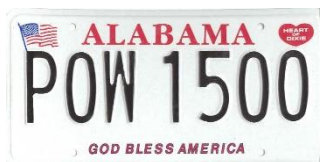
Prisoner of War