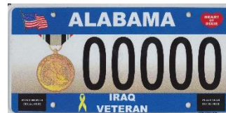
Operation Iraqi Freedom