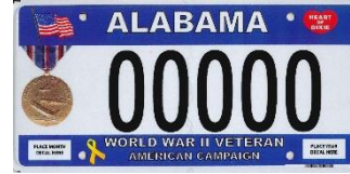
WWII American Campaign