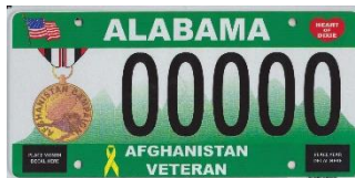
Operation Enduring Freedom - Afghanistan