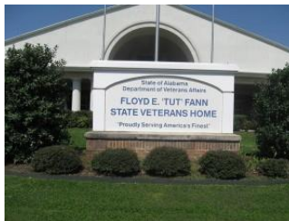
Floyd E. "Tut" Fann Veterans Home

2701 Meridian Street, Huntsville, AL 35811 Tel: (256) 851-2807/2967F