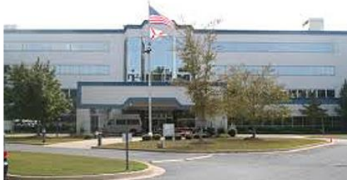
Bill Nichols State Veterans Home

The Bill Nichols State Veterans Home in Alexander City has been "home" to hundreds of veterans since its opening in 1989. In July 1995, Alabama opened two more homes to veterans, the Floyd E. "Tut" Fann State Veterans Home in Huntsville and the William F. Green State Veterans Home in Bay Minette. In November 2012, the Colonel Robert L. Howard State Veterans Home opened in Pell City.