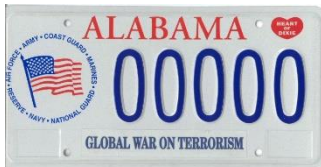
Global War on Terrorism