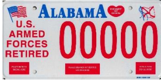
US Armed Forces Retired (Retired Military)