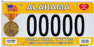
WWII Asiatic Campaign