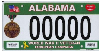
WWII European Campaign