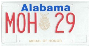
Medal of Honor