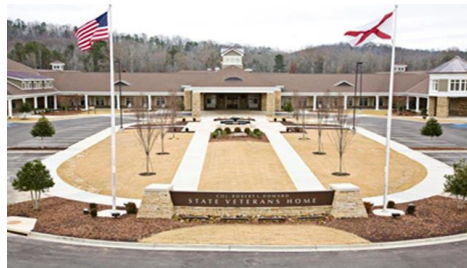
Colonel Robert L. Howard State Veterans Home 7054 Veterans Parkway, Pell City, AL 35125 Tel: (205) 338-6487